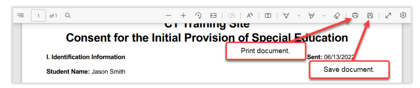
Note: Your PDF viewer may present slightly differently from screenshot.

When viewing a document, you may print or save the document using the buttons shown below.